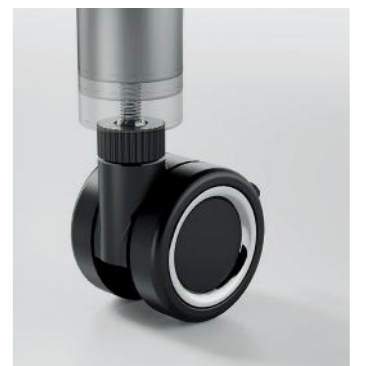
创新性设计可调节脚 Innovative design and adjustable feet.

How to use simple but not simple shape to reflect the exquisite business style is an eternal topic in the design circle.