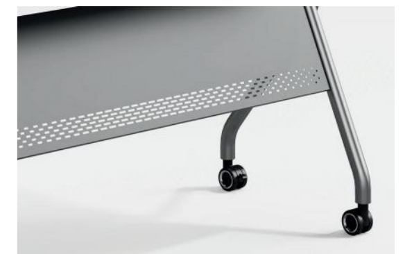
时尚钢制挡板 Stylish steel baffle.

活跃，是桌面之下看不见的流动感；创新，是桌面之上不断生成的对话 Activity is the unseen flow beneath the tabletop. Innovation is the conversation that keeps forming above it.